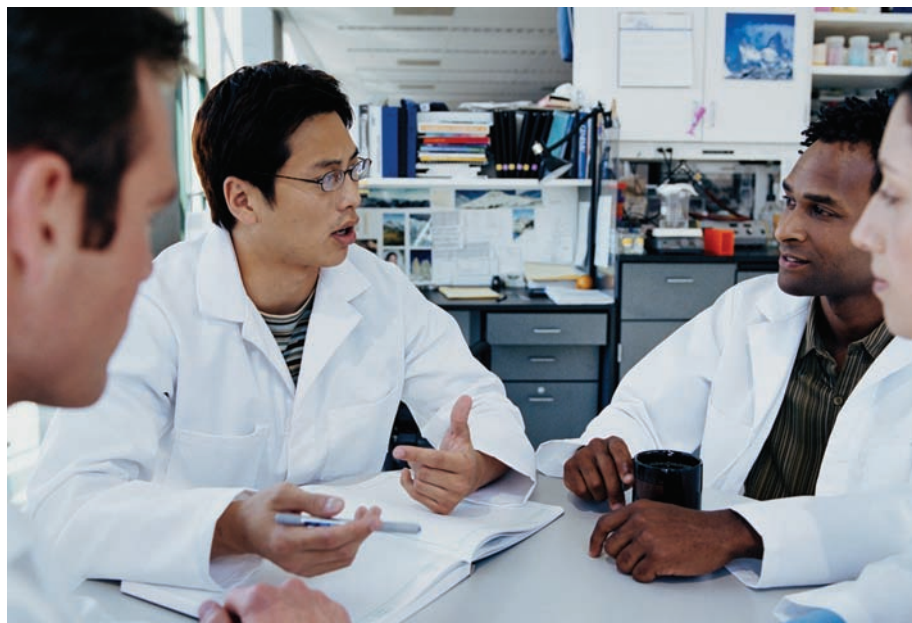
Fig. 2. Scientists routinely debate their theories, their data, and the implications. Research shows that argumentation in the classroom can improve conceptual learning.

In addition, notions of what constitutes scientific reasoning differ somewhat. Much of the research on individual's capability with scientific reasoning is a product of laboratory-based,